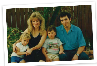
With my wife and boys (1985)