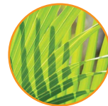
Saw Palmetto Serenoa repens