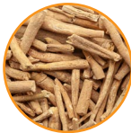
Ashwagandha Withania somnifera

In the following pages, I have included many health benefits associated with these 6 herbal formulas; Ashwagandha, Ginkgo, Ginseng, Milk Thistle, Saw Palmetto and Maca.