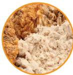
Maca Lepidium meyenii