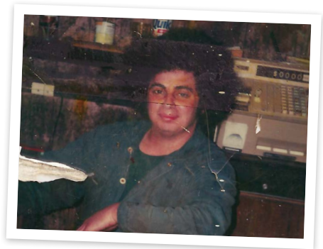
101 Kilbs (1976)