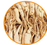
Ginseng Panax ginseng