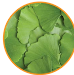
Ginkgo Ginkgo biloba