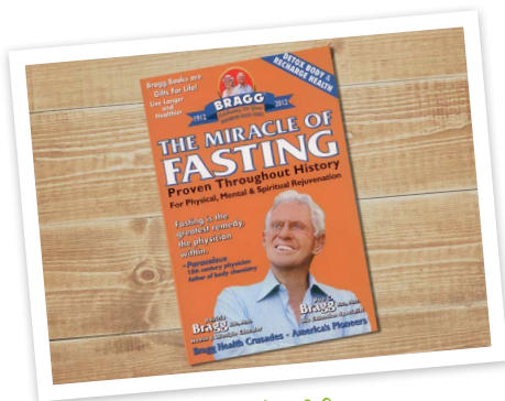
The miracle of fasting