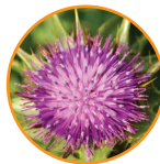
Milk Thistle Silybum marianum