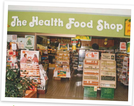
My first health food shop (1982)

health food store. At the time, that's what made me the happiest: talking to people about bowel health and the principles of natural living. So that's what I did. I quit my job as a motor mechanic and I opened the store on the 1 st of November 1982, on my 28 th birthday.